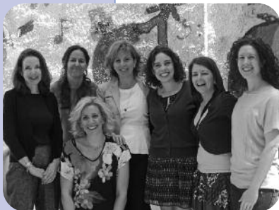
The NYSPCC staff pictured with staff from the ELIZA Society.

Child sexual abuse is a chronic, under-reported crime in the United States and throughout the world. It occurs in all socioeconomic and educational levels and across all racial and cultural groups. Victims of child sexual abuse experience a myriad of physical and mental health problems that often persist through adulthood. In order to help prevent abuse, young children need to be taught about their bodies and feelings and how to distinguish safe from not-safe touches.